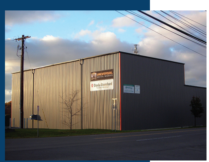
Universal Metal Works -Davis-Standard